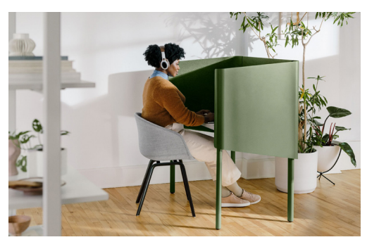
View image library